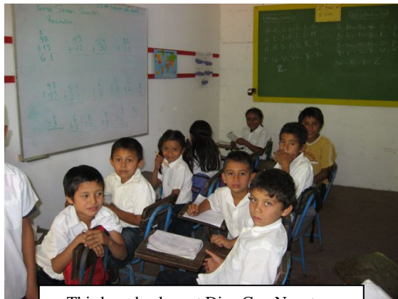
Third grade class at Dios Con Nosotros Christian school.

Our first team of the year from State College, PA joined us January 17 th for a week of work as they blessed a small Christian school with security bars, interior walls, a new paint job, whiteboards, refurbished chalkboards and even pencil sharpeners. Previously they had only temporary walls in a shell of a facility that lacked the security bars on the windows. Now the desks, chairs and whiteboards are safe from theft and vandalism and the teachers can even display posters and student work to brighten up their classrooms. When we visited the school today each desk was occupied and the students were busy working on multiplication, subtraction and dictation. We only bothered them a little with our camera (Ya... right. One little boy looked at me and asked, “Are you a gringo?”) but we were able to catch several eager faces with bright smiles as they enjoyed learning in their beautiful new classrooms.