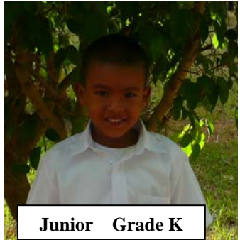
Junior Grade K

Our first team of the year from State College, PA joined us January 17 th for a week of work as they blessed a small Christian school with security bars, interior walls, a new paint job, whiteboards, refurbished chalkboards and even pencil sharpeners. Previously they had only temporary walls in a shell of a facility that lacked the security bars on the windows. Now the desks, chairs and whiteboards are safe from theft and vandalism and the teachers can even display posters and student work to brighten up their classrooms. When we visited the school today each desk was occupied and the students were busy working on multiplication, subtraction and dictation. We only bothered them a little with our camera (Ya... right. One little boy looked at me and asked, “Are you a gringo?”) but we were able to catch several eager faces with bright smiles as they enjoyed learning in their beautiful new classrooms.