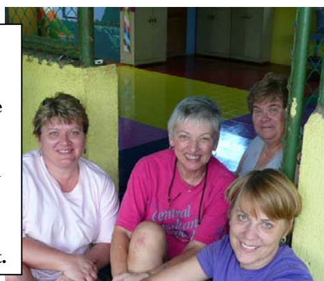
The week before the start of school these ladies from State College, PA gave the preschool floor a new coat of paint.

Today, again after 3 weeks of school, I think I finally purchased the last textbook, delivered the last few supplies and purchased the PE uniforms for the students in the scholarship program at Covanic Christian school where we have 14 students in grades K-3. Whew! Every year getting this program off the ground always takes a lot of running around and a lot of patience but it sure feels good when it's all done. It doesn't